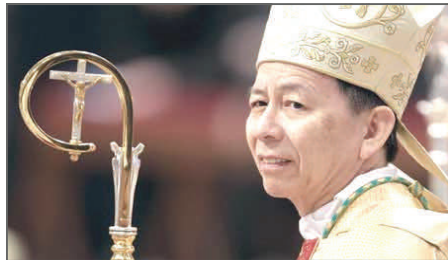
Archbishop Savio Hon

There are people in America and Europe who are pushing Chinese bishops towards this kind of action. "If you succeed," they argue, "we will follow." [1]