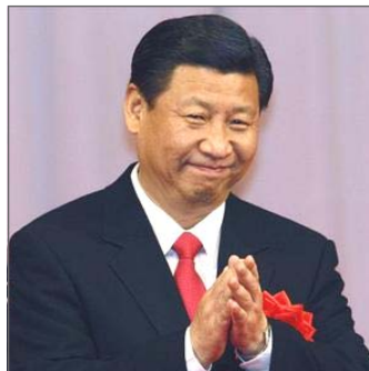
Chinese Vice President Xi Jinping was elected to succeed President Hu Jintao in 2013.

This fear of social unrest can explain the election of a third party candidate, Xi Jinping, as the successor of President Hu Jintao in 2013. This election also tells us about the direction the plenum majority wants the Communist Party to take, in order to bring about the needed and urgent political and economic reforms. For this reason, the first priority for the Communist Party is to maintain social stability at all cost. Otherwise, impossible to implement any economic or political reform adopted by the Central Committee. One can expect a greater control of public gatherings and censure of communications.